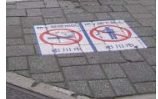
“No smoking” street, Ichikawa, Japan