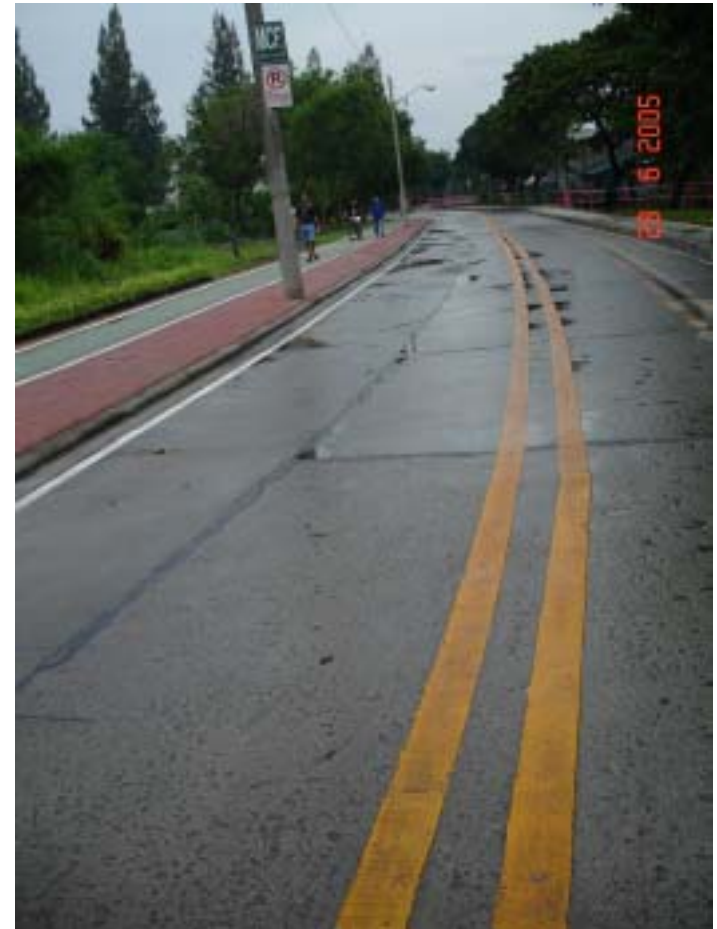
Bicycle lane, Marikina, Philippines