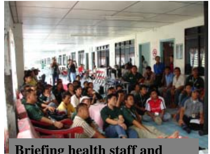
Briefing health staff and